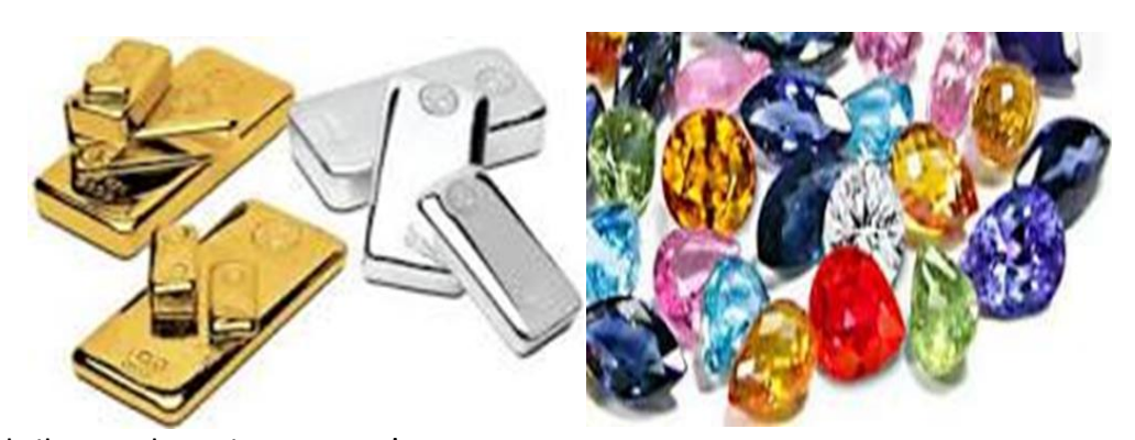
'Gold silver and precious stones', or...

11 'For no one can lay any foundation other than what is being laid, which is Jesus Christ. If anyone builds on the foundation with gold, silver, precious stones, wood, hay, or straw, each builder's work will be plainly seen, for the Day will make it clear, because it will be revealed by fire. And the fire will test what kind of work each has done. If what someone has built survives, he will receive a reward. If someone's work is burned up, he will suffer loss. He himself will be saved, but only as through fire.'